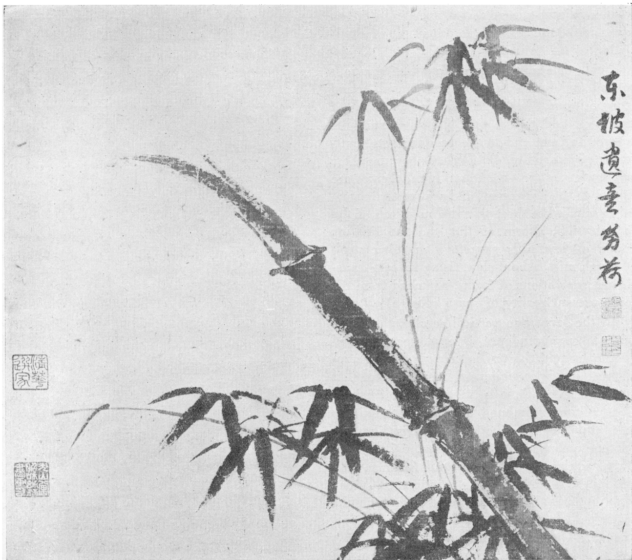
Bamboo. « An attempt to capture the inspiration of Su Tung-p'o ».