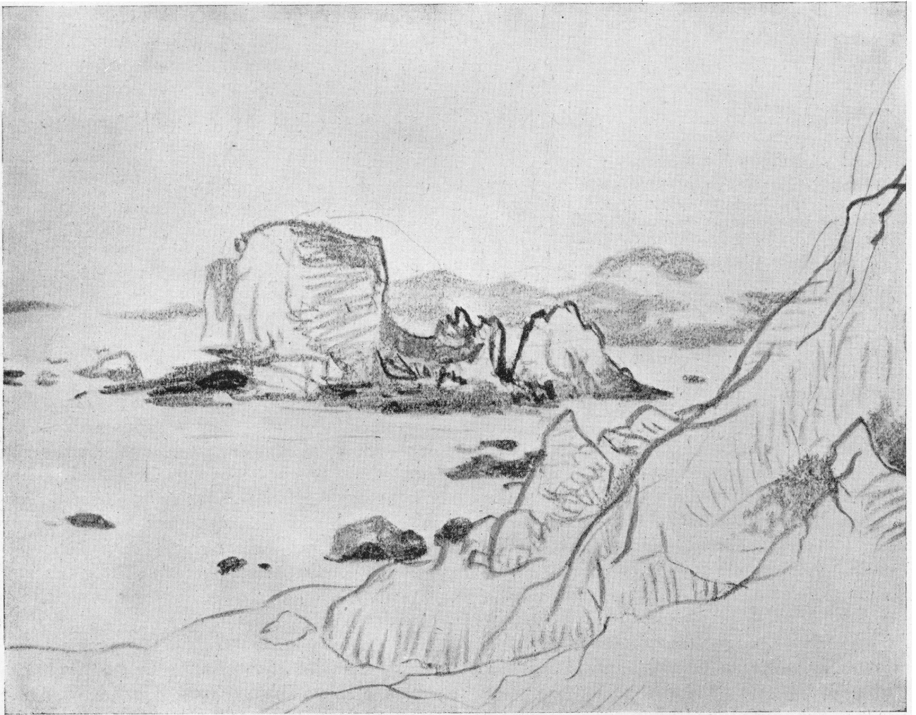
Kulangsu: The lion-rock. Pencil sketch from nature.

However spiritual may be Chinese painting in its ultimate function, it is not on the metaphysical or intellectual plane that it starts. Perhaps too much has been made of the similarities between ink-painting and brush-writing by literary critics who, in so doing,