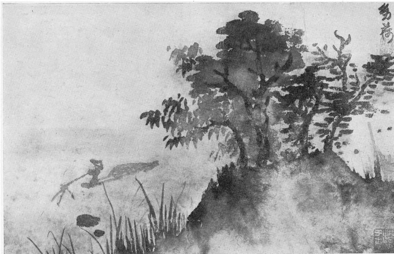
River bank. A brush sketch.

felt that they honoured painting all the more. In truth, there are conceptual incompatibilities between ideograms and pictorial subject-matter. The hieroglyph that means « tree » correctly proposes an image so devoid of personality as to fit all possible kinds of trees. It is true that the tree which the Chinese painter « writes » with the brush is not either nature's own. It has suffered metamorphosis to fit within the strange other world - two dimensional in fact and monochrome - of ink-painting. Yet, the painted tree is endowed with physical substance; retains its own height, girth and density; and grows a web of branches as characteristic as fingertip whorls, valid only for this one tree.