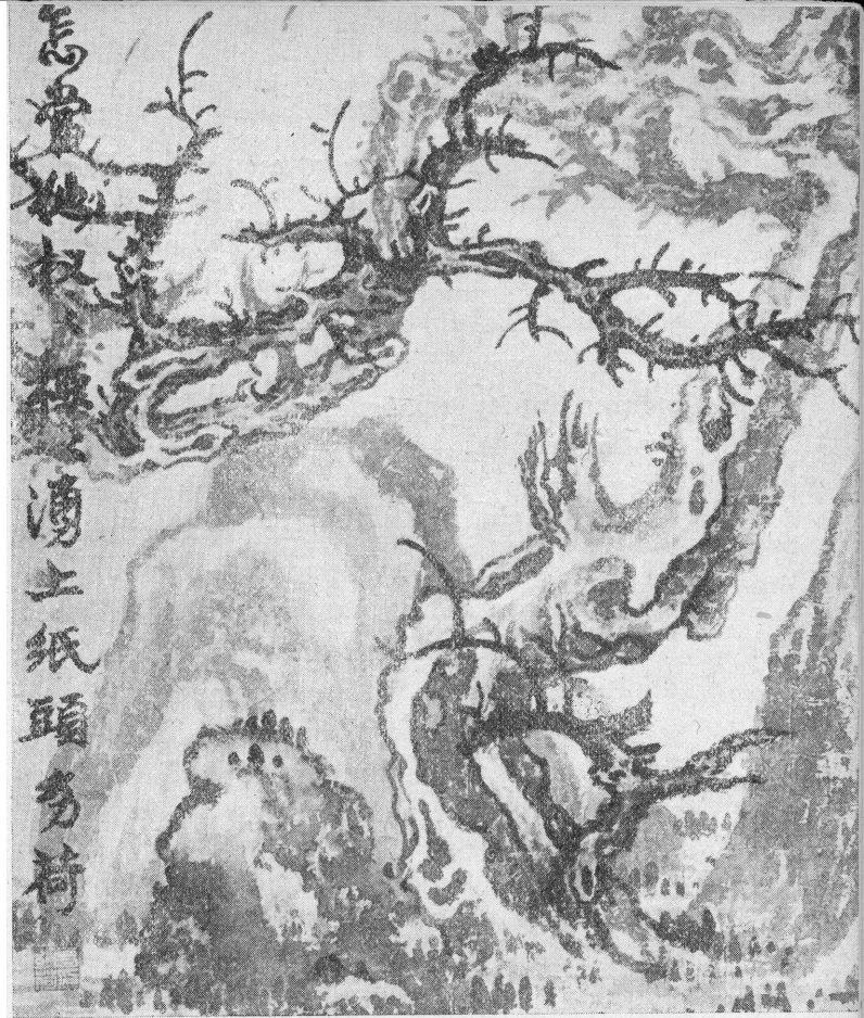
The Wicked grove. «I could not hold back the branches that floated out of my brush».

In the large size vertical scrolls, the mood rises to epic grandeur. Over the earth-bound scene, beyond the trailing clouds that are reserves of paper-whiteness, peaks loom that stretch the relationship of objects to verticality. A torsion imbued with elements akin to those of our baroque style wrings like wet cloth the shapes of nature (Figs. 6-7). Grass tufts acquire a quasi-organic animation as each blade bends downward in mimicry of spider legs, or rises as a scarab's feeler. Tree trunks pattern their restlessness after that of animal trunks. The slopes of mountains are now vertical and pocked with erosion, suggestive of imminent collapse. Even the architecture of pagodas and pavillions leans askew.